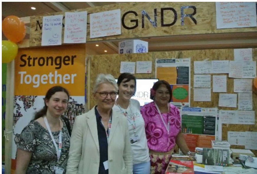
The GNDR booth at the Global Platform for DRR

GNDR's booth in the marketplace became a convening place for civil society and allowed us to build new relationships and partnerships, as well as maintaining longstanding friendships with our supporters.