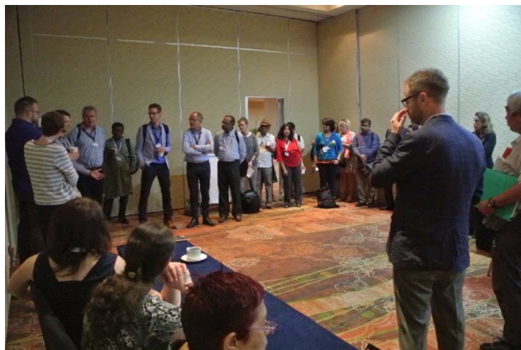
Daily civil society debrief

GNDR also held daily debriefs at 8.30 each morning during the Platform to share insights and ideas, report on meetings that had been organised, and make sure everyone was up to speed with the diverse events of the day. These were well-attended each morning, and on the final day, there was strong momentum from participants to continue communicating and working together. As such, we agreed on a coordination mechanism and a plan to monitor our own commitments in our joint statement, and to produce a report on our progress a year after the Global Platform.